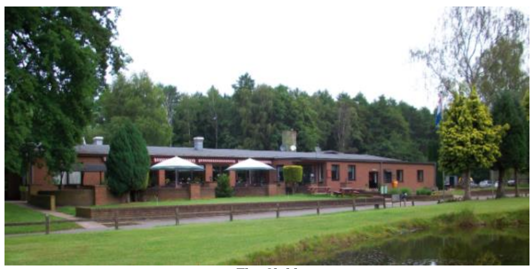
The Clubhouse -